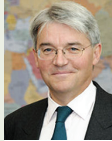
John Simpson CBE World Affairs Editor of the BBC

I much admire ZANE's valuable work amongst the poorest of the poor in Zimbabwe, particularly amongst pensioners, and for its clubfoot programme.